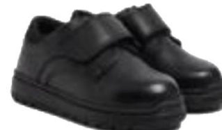
Kids' Leather Riptape Shoes £28.00 - £32.00