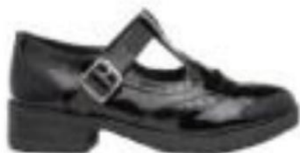
Lilley Girls Black Patent Brogue £14.99