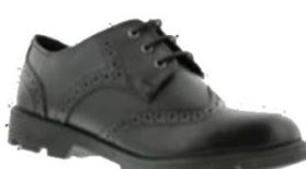
Love Leather Brodie £22