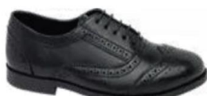
Graceland Girls Black Leather Brogue £19.99