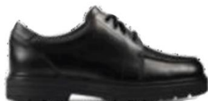
Loxham Pace Y £51.00