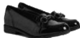
Kids' Leather Slip-On Loafers £30.00 - £34.00