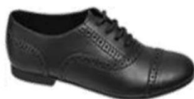
Graceland Teen Girls Lace Up £19.99