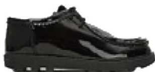
Girls Patent Lace Up School Shoes £12.00