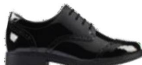
Aubrie Craft Y £50.00