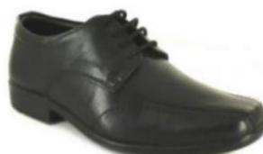
Rockstorm Jon £24