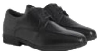
Kids' Leather School Shoes £32.00 - £36.00