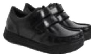
Kids' Leather Freshfeet Shoes £30.00 - £34.00