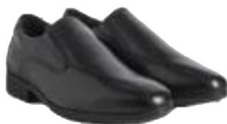
Kids' Leather Slip-On Shoes £32.00 - £36.00