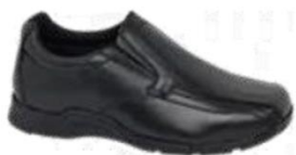
Mephis One Black Boys Slip On £19.99