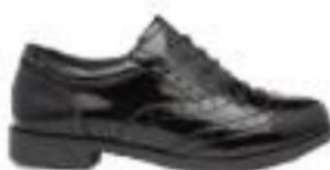
Lilley Girls Black Patent Flat Lace Up £12.99