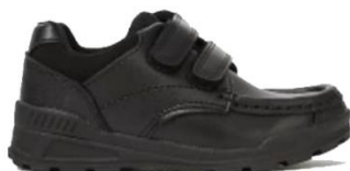
Boys Leather 2 Strap £12.00