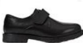
Beckett Boys Black Formal Lace Up £14.99