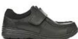
Beckett Boys Black Slip On Formal £14.99