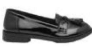
Lilley Girls Black Patent Loafer £14.99