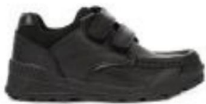
Beckett Boys Black Touch Fasten £9.99