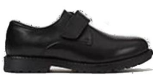
Boys Leather Chunky 1 Strap £12.00