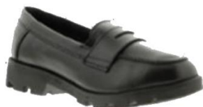
Love Leather Leana £20