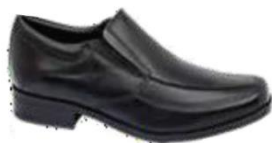
Memphis One Formal Slip On £24.99