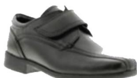
Comfisolet Percy £14