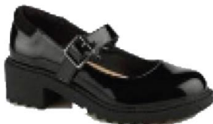
Girls Micro-Fresh Patent School Shoes £14.00