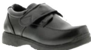
Rockstorm Albie £12