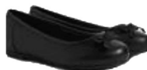
Kids' Leather Ballet Pump £24.00 - £28.00