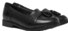
Kids' Leather Freshfeet Loafers £30.00 - £34.00