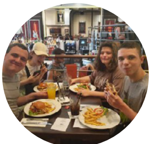
Hard Rock Cafe